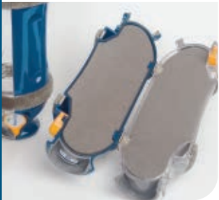
Three styles of foam inserts – Pillow, Egg Crate and Thin – are available to cushion fragile cargo.

Pevco TEC-6™ carrier is designed to be used with 6" hospital pneumatic tube delivery systems and is available in four color combinations.